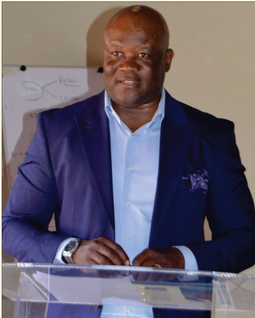
Gaoage Oageng Molapisi MPL MEC FOR PUBLIC WORKS AND ROADS